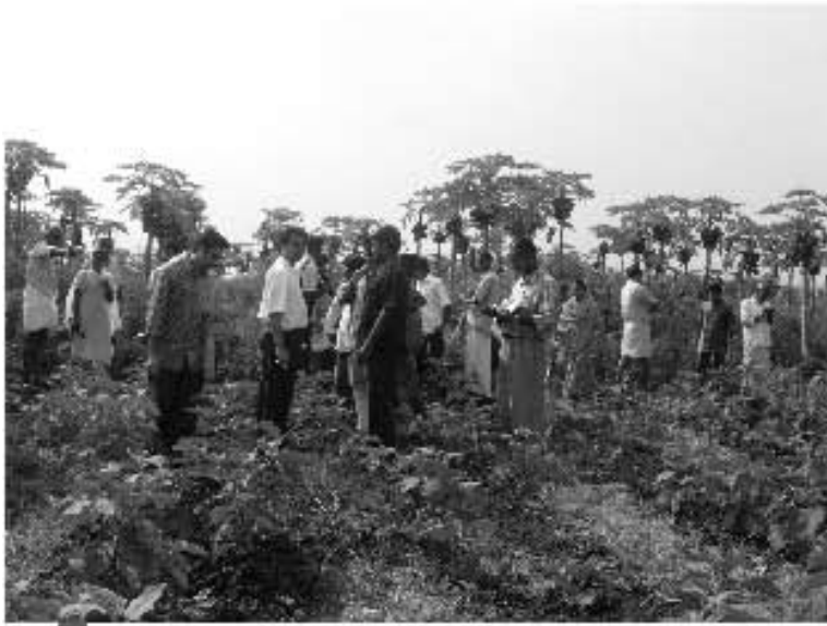
Study visit to an organic farm in Wardha district in progress. Farmers were very excited with the things they saw