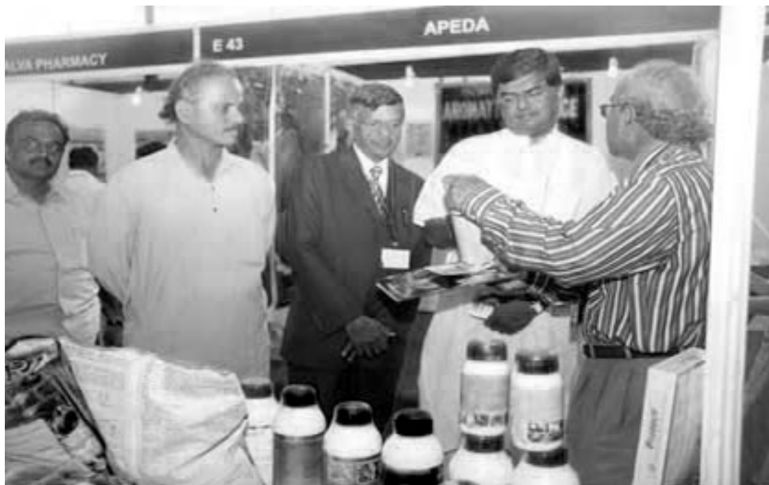
ICCOA President and other visitors at the ICCO Organic Farming Trade Fair

Claude Bourguignon has shown that that between 92-98% of the plant's sustenance comes from the atmosphere and only 3-4% from the soil. In other words, plants feed quantitatively from the atmosphere, qualitatively from the soil. Modern agriculture, husbanded by chemical factories, has turned that upside down. Now we feed the plant quantitatively from the soil. However, as common sense will indicate, the plant can take only that which it can absorb. Everything else goes into the environment. But the pernicious effects of these artificial salts is on the living organisms that they