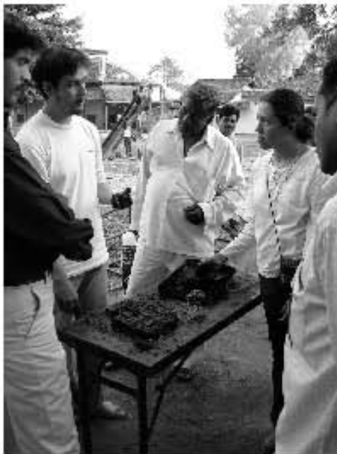
Agricultural graduates from Mexico demonstrate how to make a mud base for seedlings in place of plastic bags.