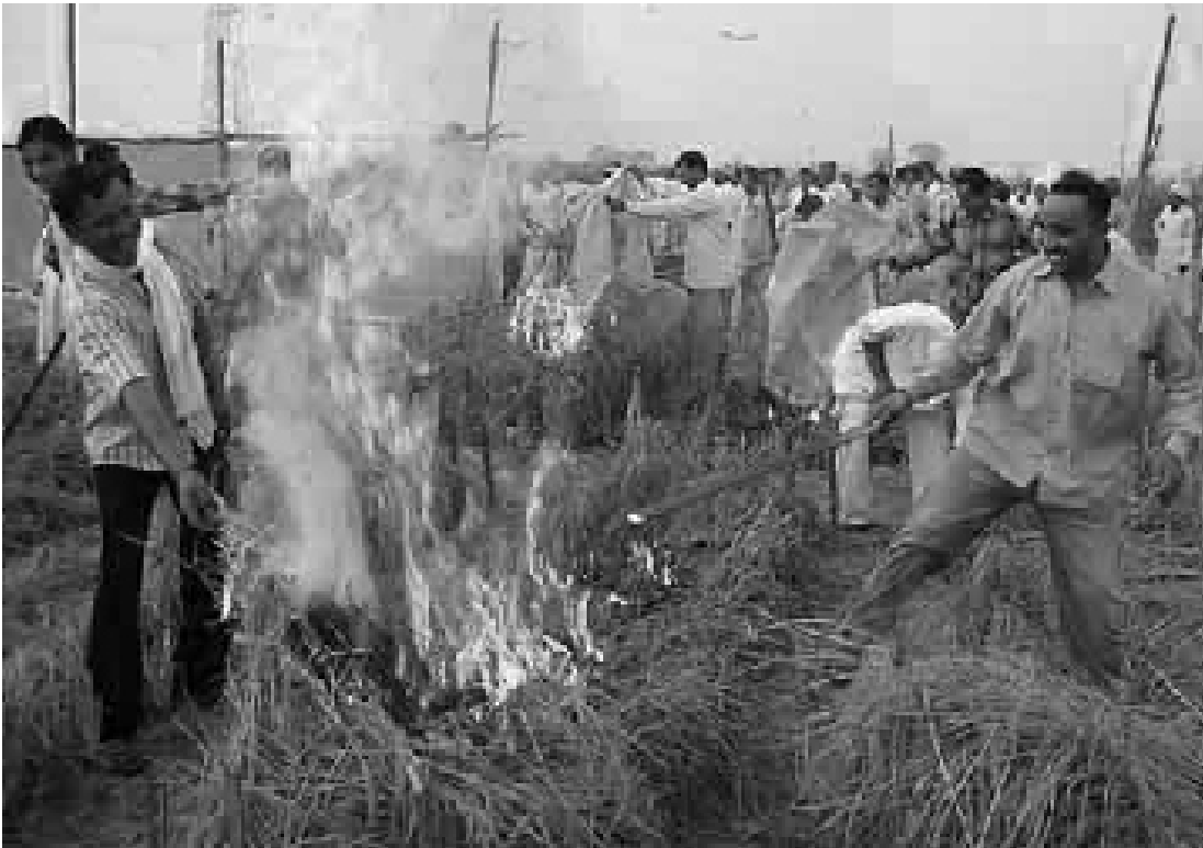
Bharatiya Kisan Union members prevent possible contamination from a GM rice plot in Haryana by dousing the fields containing the crop in flames.

Karnal, October 28, 2006: Over 500 activists of Bharatiya Kisan Union [BKU] and scores of villagers of Rampura village in Karnal district of Haryana destroyed a GM Rice plot in Haryana to prevent contamination from the rice plot and to ensure that DBT guidelines are not flouted. The BKU activists who went to investigate the trial in Rampura village found out that the farmer, who had leased out his land to Mahyco for Rs. 15,000/- for two acres had not been informed by the company about what kind of seeds are going to be sown on his land. Similarly, the panchayat head has not been given the full details of the trial.