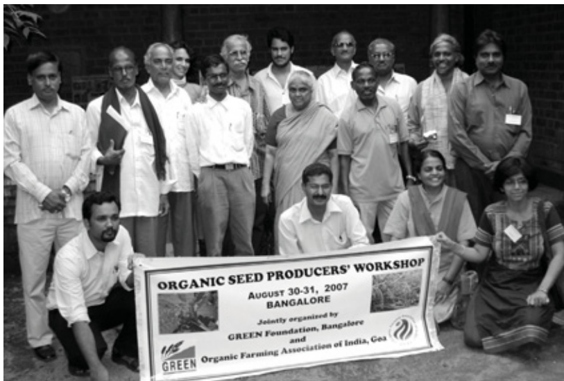
Participants of the meeting on organic seeds in Bangalore end August 2007

The Green Foundation was entrusted with this assignment and to circulate the format to the participant groups. Groups agreed to send the varietal information with photographs wherever possible. The updated information would be put into a printed catalogue which would be circulated among the network members. It will be an informal, non-commercial exchange network of organic seeds. Supply of seeds included in the catalogue would be ensured by the respective groups upon enquiries from the interested farmers or groups.