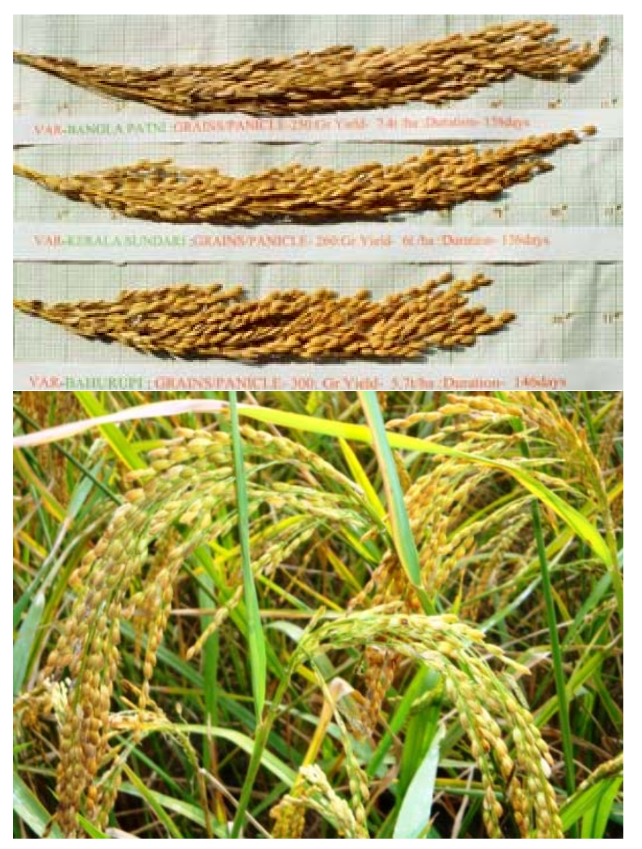
Panicles of Bahurupi