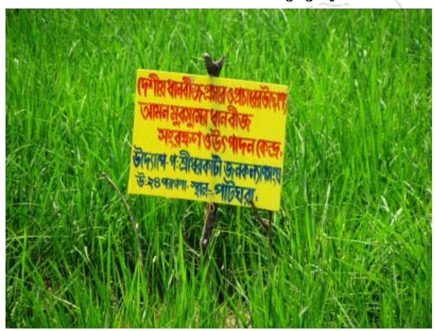
Rice conservation at Hingalgunj

Rays of Hope: International organisations like the United Nations (UN), the Food and Agriculture Organisation (FAO), national governments, institutions, scientists working in mainstream agriculture, civil society and farmers have started realizing the importance of cultivation of folk crops and conservation thereof in farmers' fields. Though there is an institutional apathy towards folk crop conservation and there is hardly any allocation of funding for promotion and studying the folk rice varieties. The UN has declared 2011-20 as the Decade of Biodiversity. The Biodiversity Act, 2002,