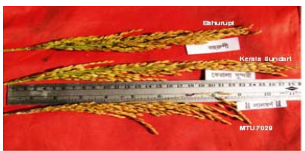
Comparison of Panicles

seeds, fertilizers and pesticides. But many of them have started to raise the question about the efficacy of modern varieties regarding the consistency of grain yield and the cost of production.